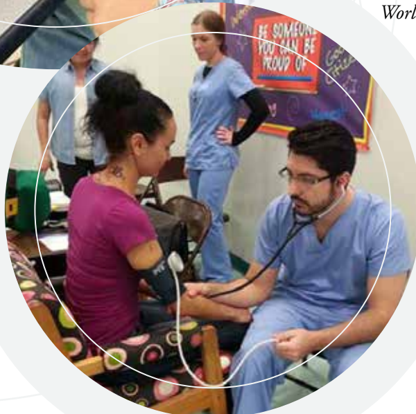
2025 Grantee Light of the World Clinic