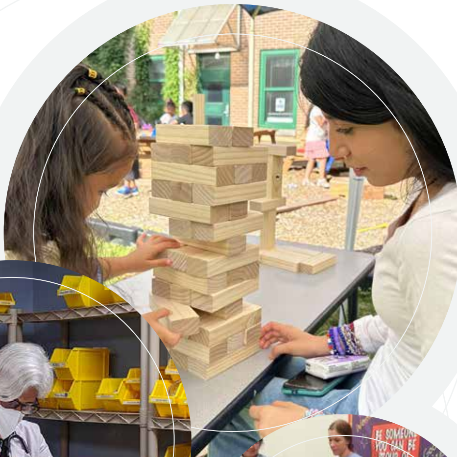
2025 Grantee Light of the World Clinic